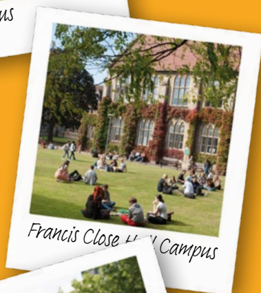
Francis Close Hall Campus